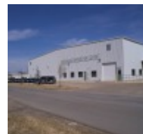
The previous Voice of the Martyrs building, now for sale for $1,600,000 in Bartlesville, OK, USA.

PO Box 5161 Torrance, Ca. 90510, USA. Email: appeal@wurmbbrandmichael.com . Contact Information for VOM: Ph.(877)337-0302 PO Box 443 Bartlesville, OK 74005-0443