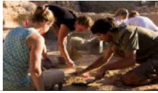
"Whenever archaeology appears to conflict with the Bible eventually the Bible has been proven true"

No book has suffered attack like the Bible. Historians, archaeologists and now 'Bible scholars' diligently attack its divine authorship. Yet, whenever archaeology appears to conflict with the Bible, eventually the Bible has been proven true! Such findings as the burial boxes of New Testament figures and the official seal of Jezebel (1&2 Kings) have put an end to many debates. Not one single archaeological find has conclusively